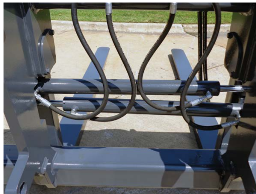
Hydraulic Option Available